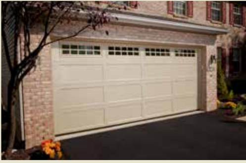
2073 in sahara tan with colonial windows