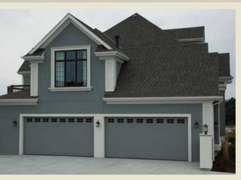
2080 in charcoal with colonial windows