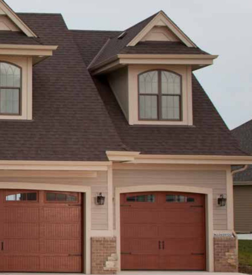
2064 in mahogany with 3-pane arch windows, hinges and handles