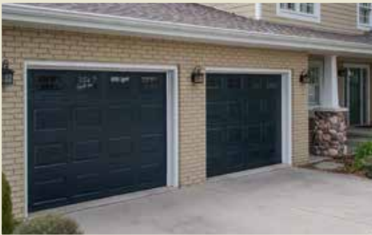
2080 in cool black with colonial windows