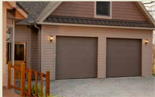
2010 in bronze