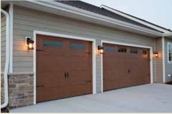
2060 in ash with 3-pane windows, hinges and handles